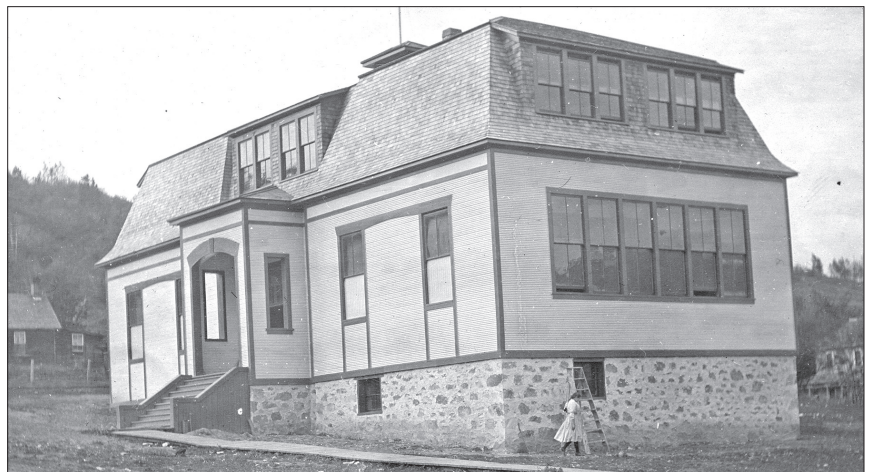
Enderby Public School in 1907 after the second floor was added. [edms 4929]

The school's low ceiling made hot weather a trial for teachers and students.