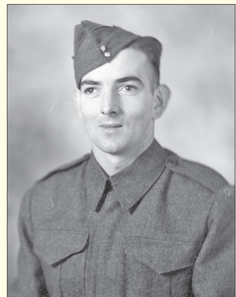
James McKay was killed in action during the Second World War but he is far from forgotten by those he helped liberate in Holland. [edms 1869]

Check out the projects at https://www.project44.ca/ and https://www.facestograves.nl/ .