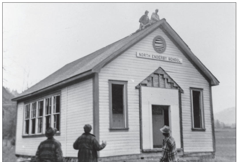
The North Enderby School after it was moved to the Neilson property in 1958.