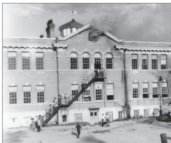
The 1975 fire at Fortune School resulted in many changes for local students. [edms 3075]